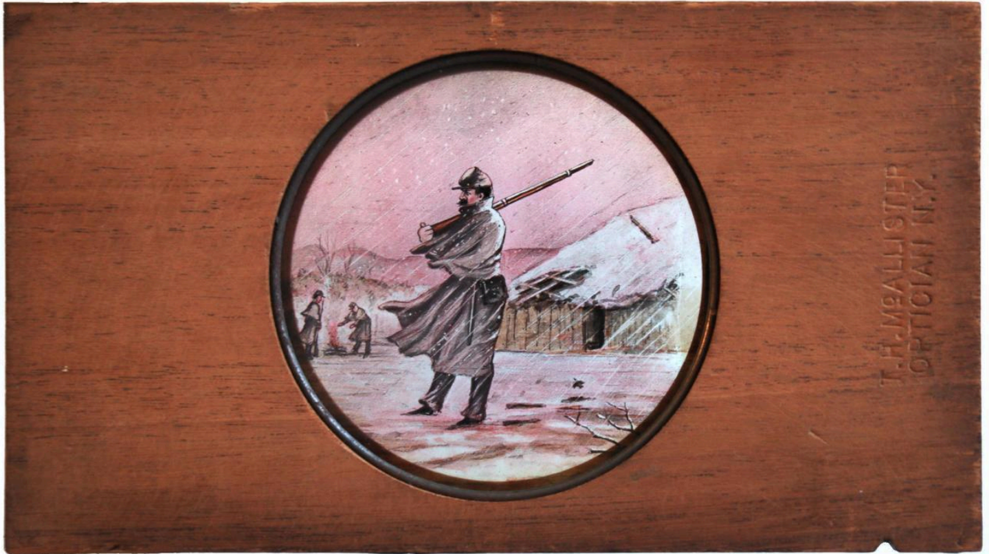
Untitled [Northern soldier on picket duty in the snow], hand-colored glass lantern slide, 3 in. diameter (image); 4 x 7 in. (frame)